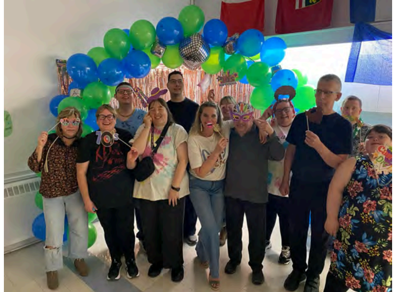
70's dance enjoyed by all. It was great to connect with old friends and meet new ones. Thank you for a great time, Owen Sound Community Living!!