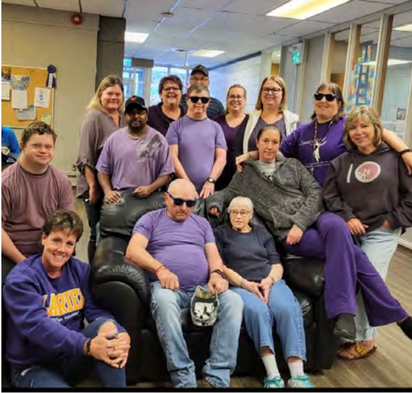
Autism Awareness day wearing our purple!